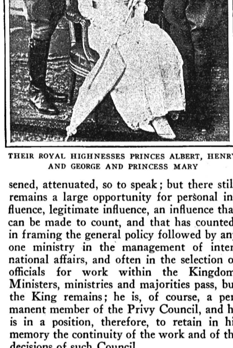
THEIR ROYAL HIGHNESSES PRINCES ALBERT, HENRY AND GEORGE AND PRINCESS MARY

sened, attenuated, so to speak; but there still remains a large opportunity for personal influence, legitimate influence, an influence that can be made to count, and that has counted, in framing the general policy followed by any one ministry in the management of international affairs, and often in the selection of officials for work within the Kingdom. Ministers, ministries and majorities pass, but the King remains; he is, of course, a permanent member of the Privy Council, and he is in a position, therefore, to retain in his memory the continuity of the work and of the decisions of this Council.