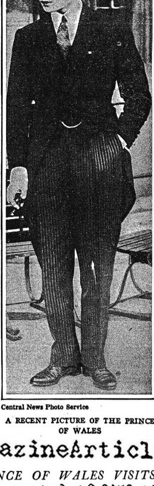
A RECENT PICTURE OF THE PRINCE OF WALES

The address given by Bryce as chairman, presented a forcible and eloquent statement of the relations of the two countries as they had been and as they ought to be. Bryce's address was followed by that of Winston Churchill, who was present at the meeting as the official representative of His Majesty's Government, and whose speech was a carefully studied historic summary. For the earlier period of the relations between America and England, Churchill followed the lines of Trevelyan's "History of the American Revolution." He emphasized the fact that the Colonials were fighting not against the people of England, but against the King's government.